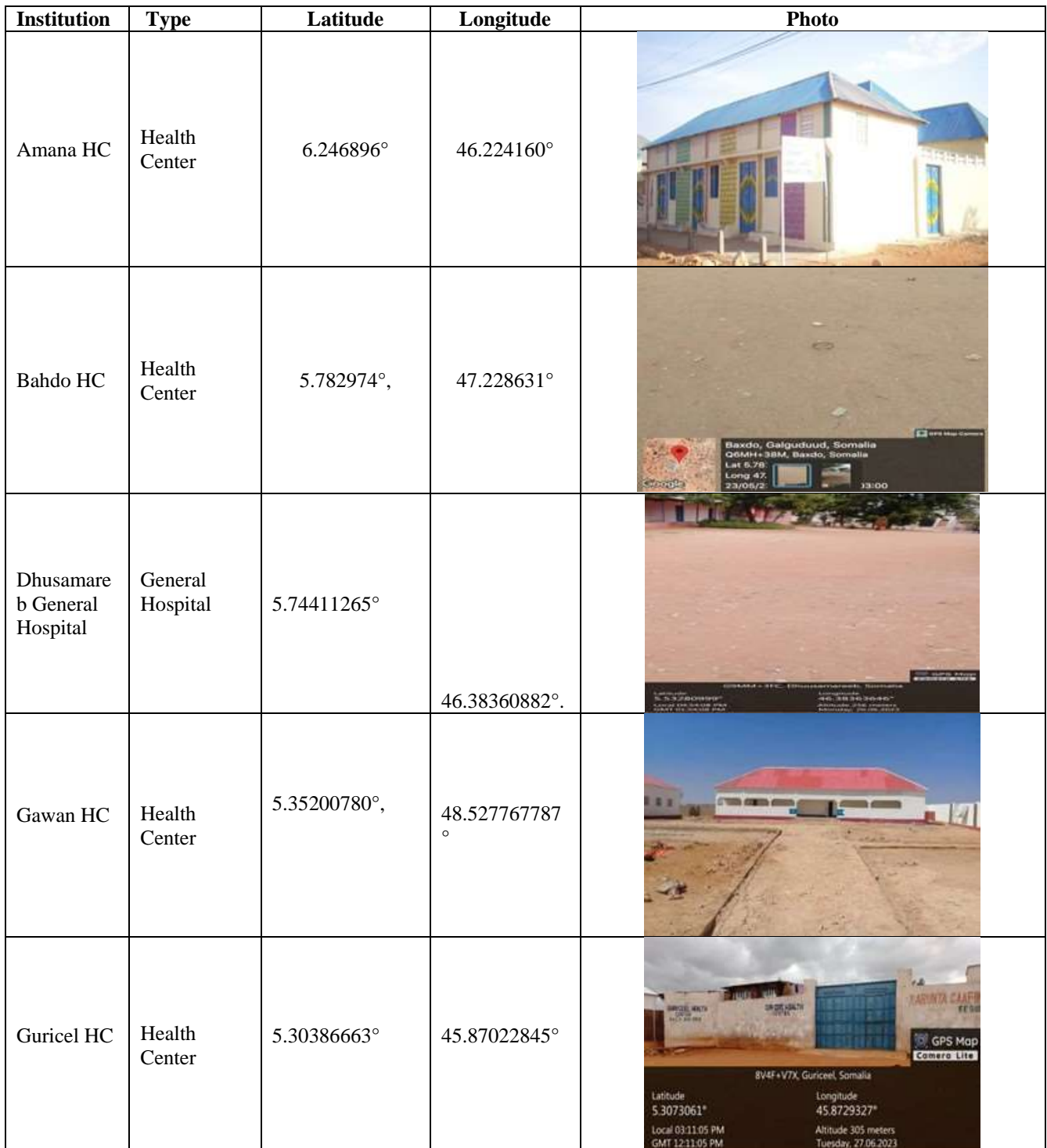
Table 2-2: Geographic Locations and Proposed Sites for the New PV System

10. Additionally, the survey included photographing the availability of areas within the premises of the target HCFs, where PV systems can be placed, including the option of roof-mounted PV systems where open lands could not be found.